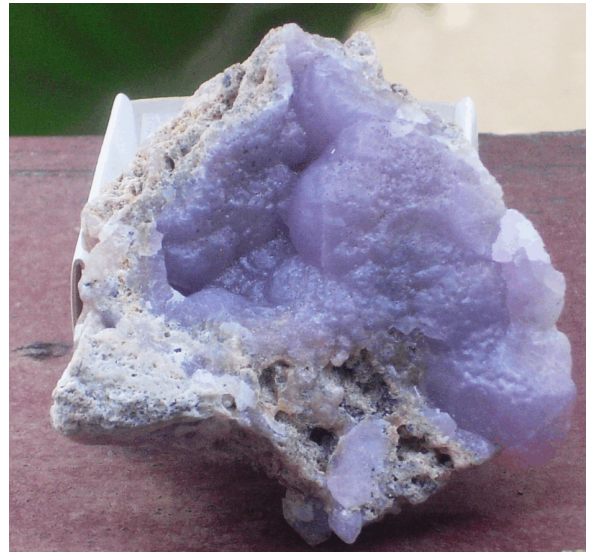
Smithsonite , El Refugio Mine, Choix, Mexico.