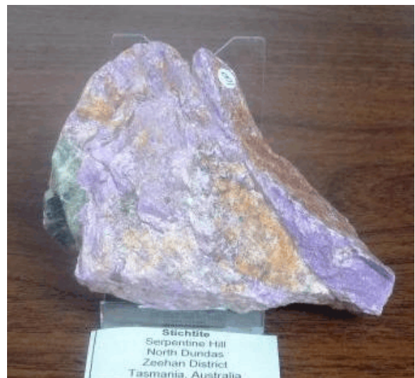
STICHTITE , Serpentine Hill, North Dundas, Zeehan District, Tasmania, Australia, above and below.