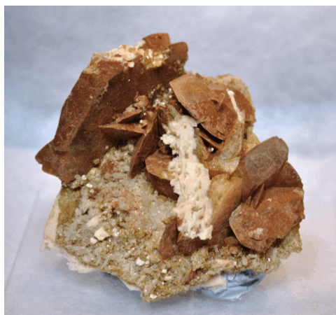
Figure 2. Hydroxyl-Herderite crystals on matrix about 2.25" across for $90.

Hydroxyl-Herderite , Lavra do Jaime, Linopolis District, Divino das Laranjeiras, Minas Gerais, Brazil. We had special requests for this rare mineral and were happy to pick up a few pieces to offer you: