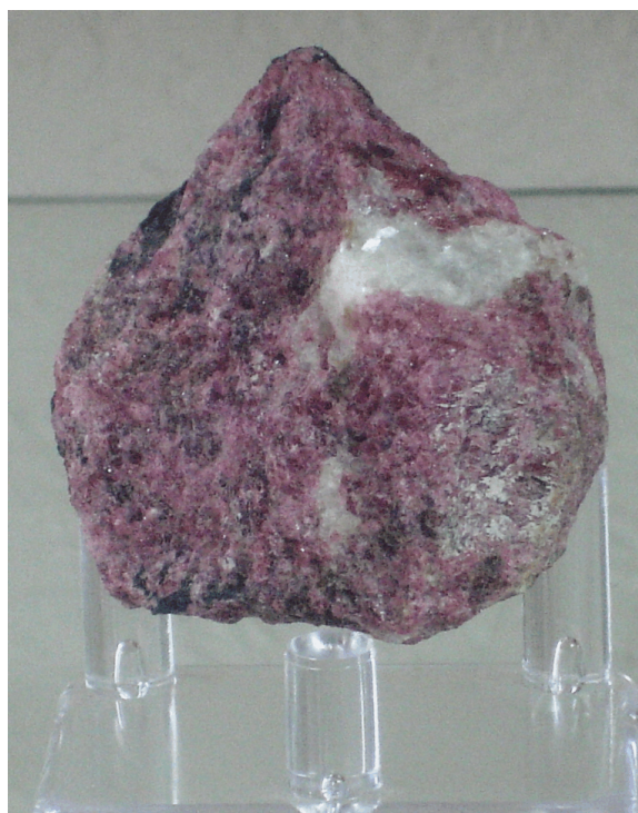
Figure 3. Eudialyte with associated minerals from Quebec, Canada.

We also have some great specimens left over from last month's Offer sheet, which you can view on our by following this link: http://www.mineralofthemonthclub.com/June%202010%20Offer%20Sheet.pdf