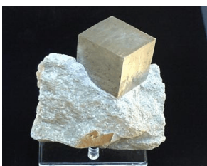
Pyrite from Spain.

But we do have a few of the smaller pieces left-- Choose any of the following for $8 each: .5" cube on 1.25" by 1.25" matrix; pair of twinned cubes sans matrix, about 1" across; or large single cube about 1" by 1" by 1" without matrix; or better yet, one of each for $22! We can supply these in larger quantities as special prices, so let us know if you're interested.